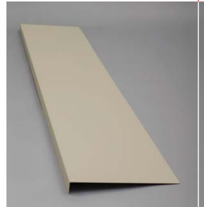
Matching foundation plates with a powder coat finish are now available

Eliminates the time and expense required by the homeowner to paint the door after it is installed